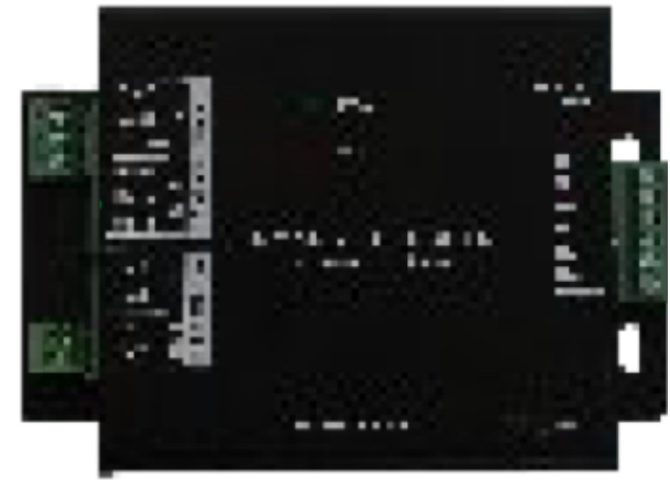
Build-in DMX decoder